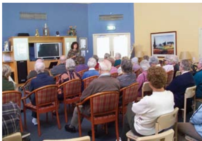
Ashlar Glen & Dianella seminar

The seminar was also held on Thursday 27 th August at the Ashlar Glen and Dianella Villages for a "full house" attendance.