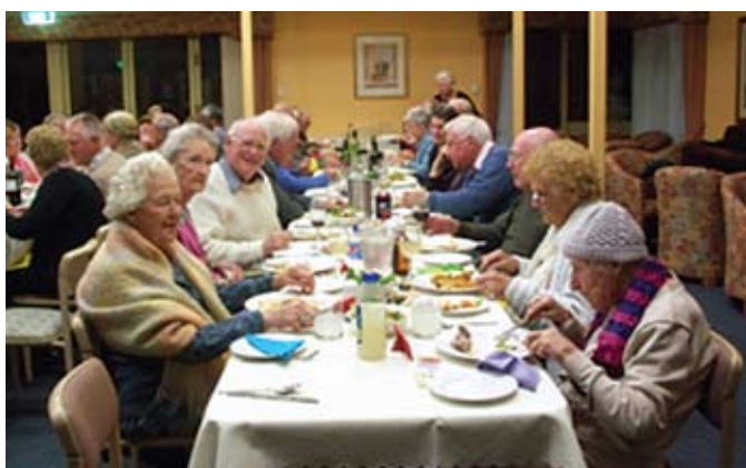
Tucking in Italian style

The ever popular raffle was well received by the company with many prizes bringing happiness to the lucky few as usual.