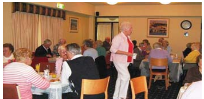
The Fathers Day Big Breakfast